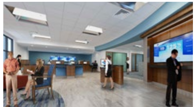
Main lobby view concept