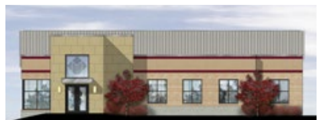
Entrance of renovated branch