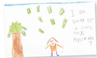
Alyssa, Age 7