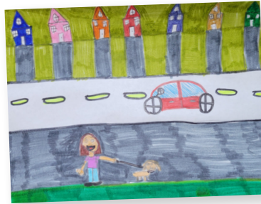
Alyssa, Age 10