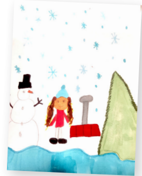
shelby, age 10