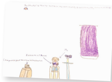
Abrielle, age 10

We received some amazing artwork for our contest about ways you plan to earn an allowance. Thank you to everyone who shared a creative entry!