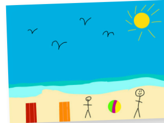
Hope, age 12