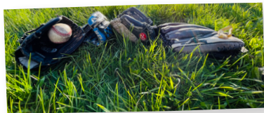
Ethan, age 10