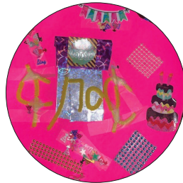
Olivia N., age 7, made a wish coin that can purchase anything you wish.