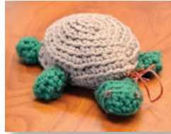
Elyse W., age 11