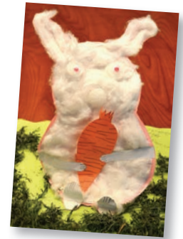
Denver R., age 6