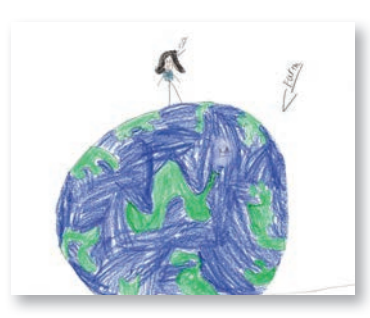
Ava, age 6, is saving to take a trip around the world!