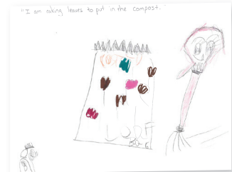
Sienna, Age 5