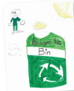
Westin, Age 6