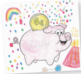
Shelby, Age 8